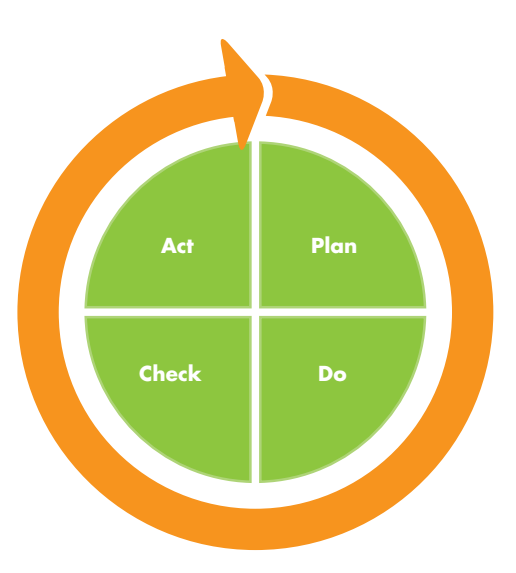
Graph 4 The Deming Quality Circle

Like any other activities, international activities must also be evaluated to get information about achievement of goals, quality of work and development needs. The most important thing is to evaluate how the targets set for international cooperation have been achieved both from the perspective of the organisation and the individuals. Activities can be assessed, e.g. by using indicators to measure sub-processes (e.g. mobility statistics) and by collecting feedback from participants and partners. Feedback from students can give information, such as their satisfaction with international services, their wishes for optional course provision and for target countries of student exchanges.