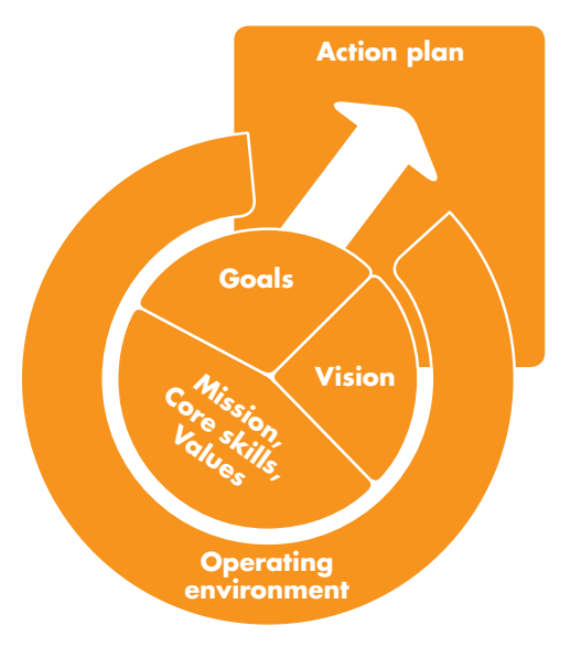
Graph 2 Elements of strategic planning

Graph 2 presents a simplified model for strategic planning to describe incorporation of the international perspective in strategies.